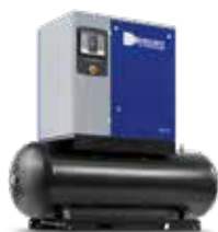
Tank Mounted version without dryer