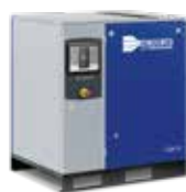
Floor Mounted version without integrated dryer