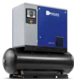
Tank Mounted version with integrated dryer